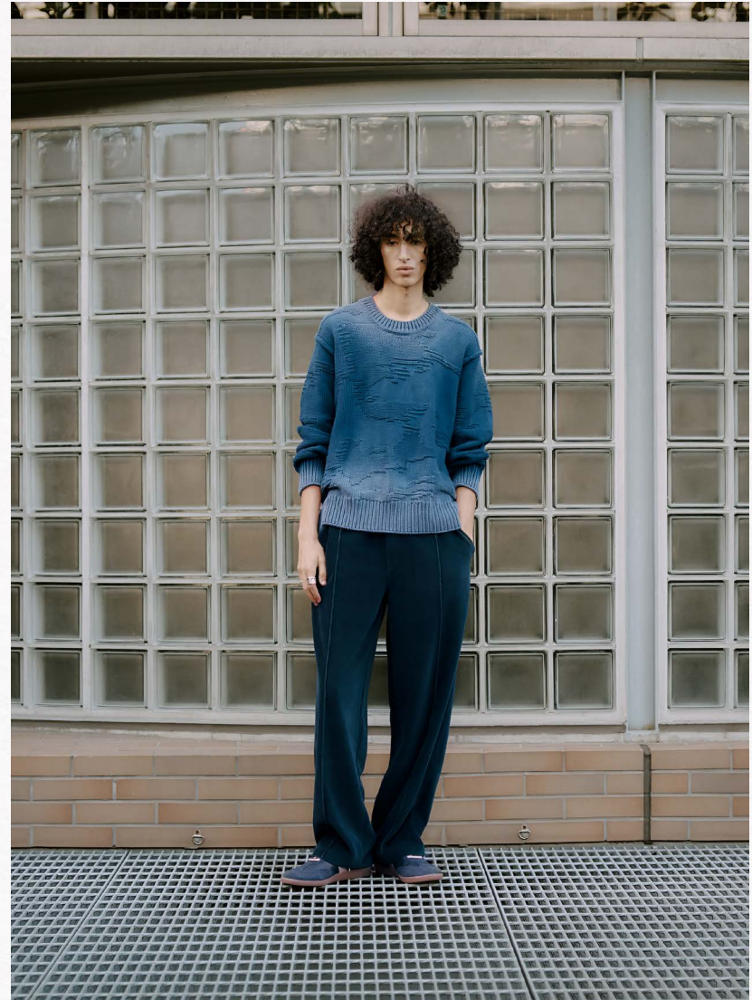
Ander Pants 202003-4251