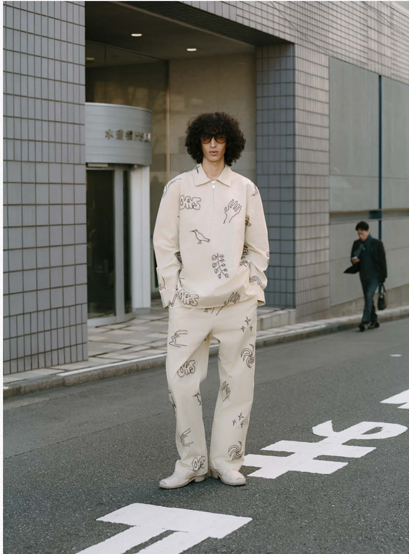
Timu Pants 202004-8252