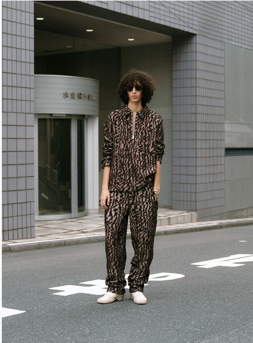
Ayora Pants 202002-3251