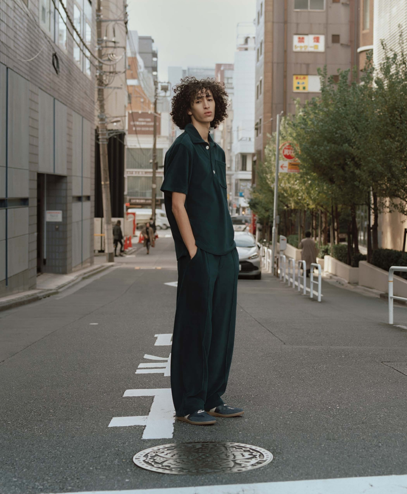
Girona Shirt 101004-4251