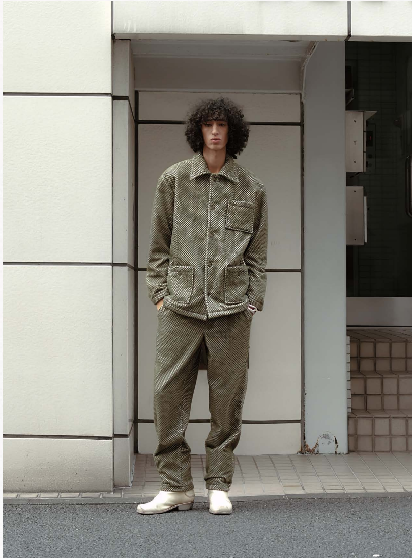
Ayora Pants 202002-2002