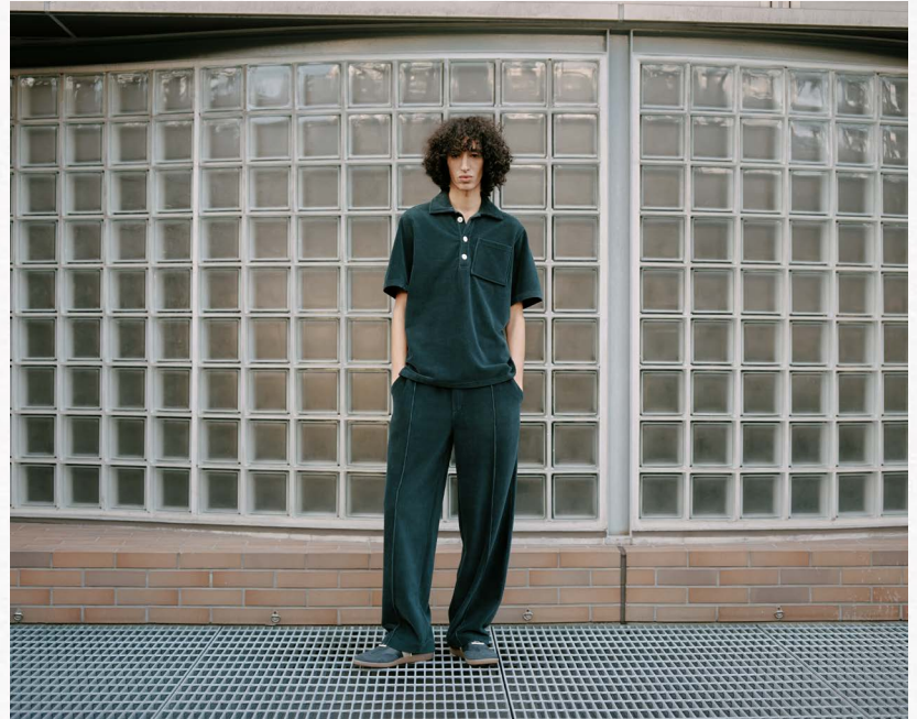
Ander Pants 202003-4251