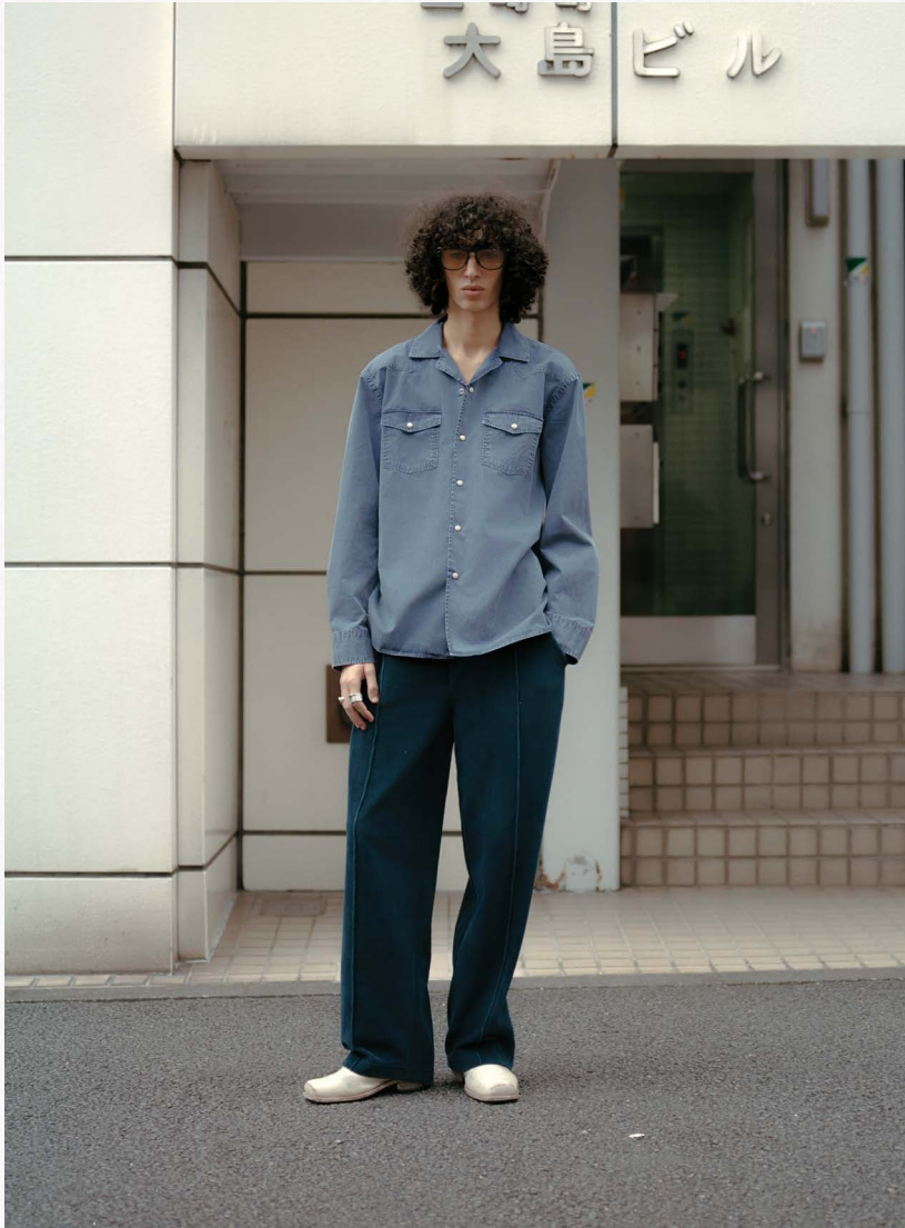
Ander Pants 202003-4251