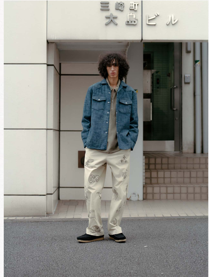
Timu Pants 202004-8252